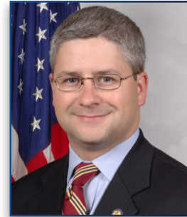
Patrick McHenry for U.S. Congress