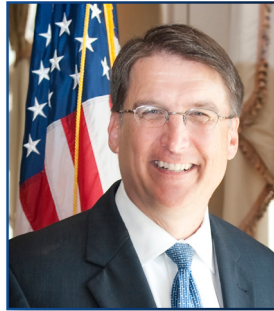
Pat McCrory for Governor